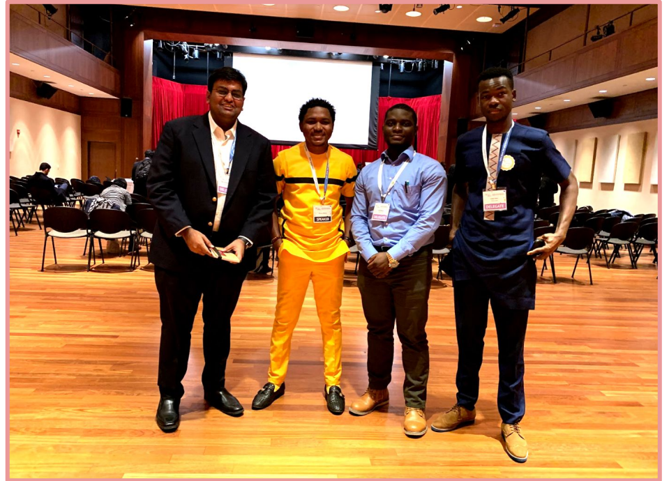
Session: Developing sustainable communities via education