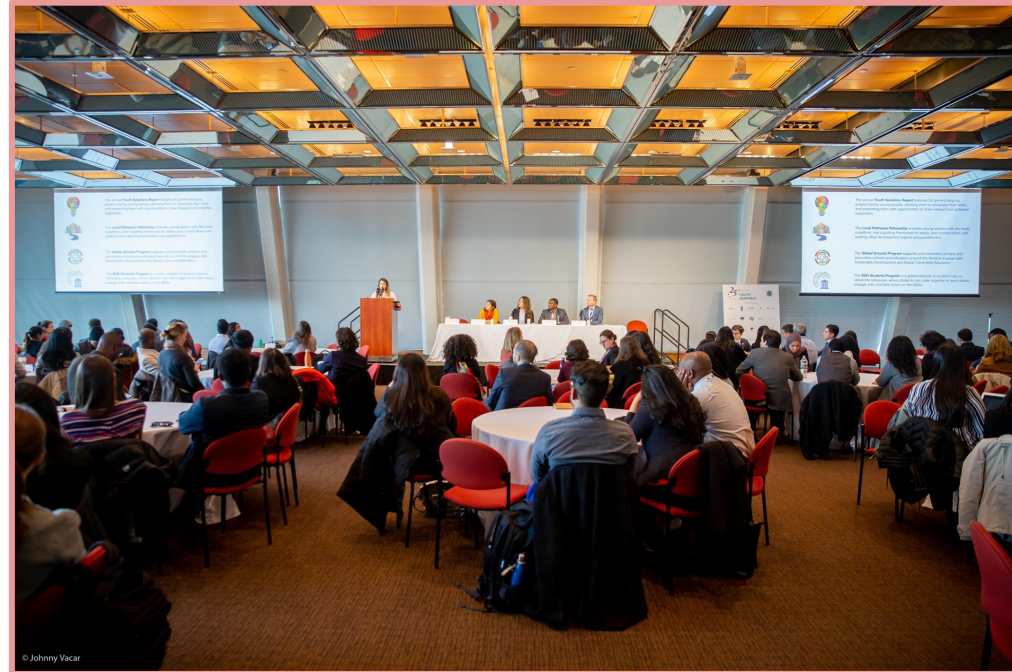
Session: Educating for Employment, Society and Change