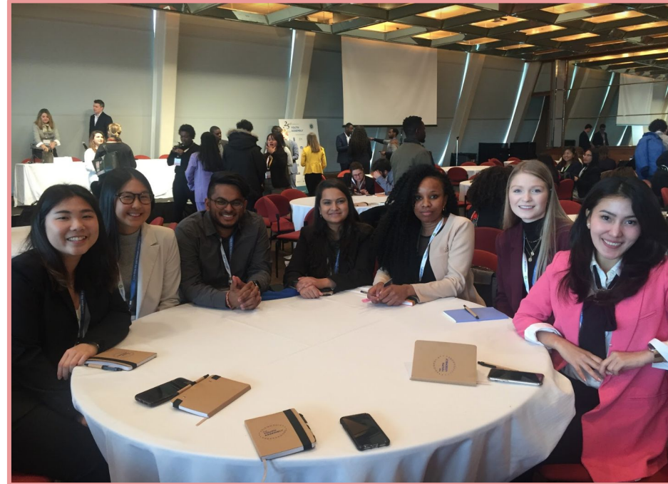
In conversation with global youth delegates on pressing issues the world faces