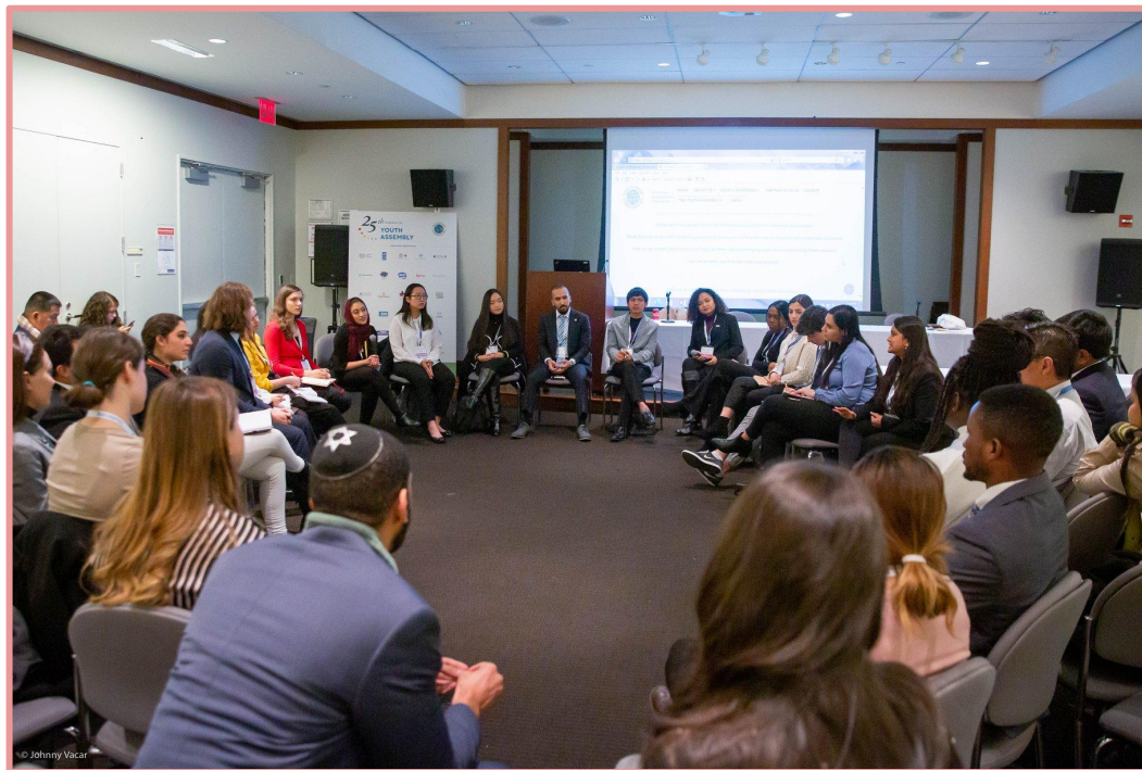
Declaration of Priorities: Peace Discussion